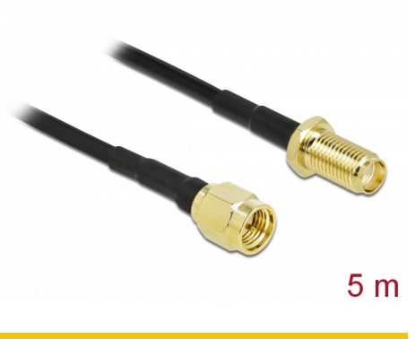
Item no. 90441

The antenna cable by Delock is suitable for connecting components of radio frequency technology.