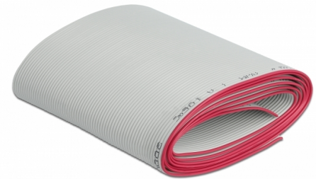
64 Pin / 1 m

This flat cable by Delock allows cable assembly with existing connectors for flat cables. The cable has 64 individual strands and can be used e.g. in test environments or in hobby applications.