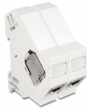
Anwendungsbispiel mit Stecker