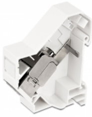
Anwendungsbispiel mit Stecker