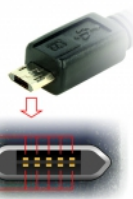
EASY-USB PCB with both sided contacts