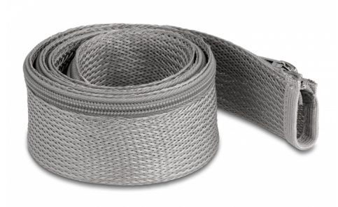
Ø 50 mm / 1 m

The braided sleeve is characterized by its high abrasion resistance, flexibility and heat resistance.