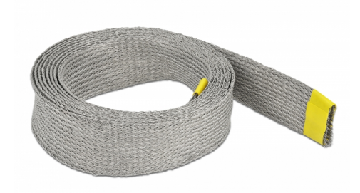
Ø 25 mm / 2 m

The copper braiding has a high flexibility to protect cables from excessive bending. The sleeve also impresses with its stretchability, which allows it to accommodate several cables or wires with different diameters. Due to the strong fabric structure, the cables will be protected from the weather and damage.